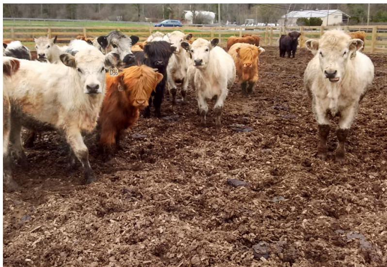
Woodchip pad in operation during late spring in northern Vermont.

Woodchip pads are livestock heavy-use areas that have a drainage layer overlain by woodchips as a surface material. These systems have been used for years on beef and dairy farms in Ireland, the United Kingdom, and New Zealand, and have been documented to improve animal performance (Table 1). Systems require careful siting and design due to environmental and management considerations. Construction entails the excavation of soil to a 24" depth, followed by a shaping of the subgrade into a 'ridge and valley' configuration to encourage drainage. The subgrade is covered with geotextile, and then perforated pipe is placed in the valleys and connected to a solid pipe, which slopes to an outlet. A 12"-18" layer of drainage stone is placed over the pipe and subgrade, followed by a 10"-12" layer of selected woodchips. The perimeter of the pad is fenced and surface-bermed to prevent any off-site water from entering the pad's drainage system.