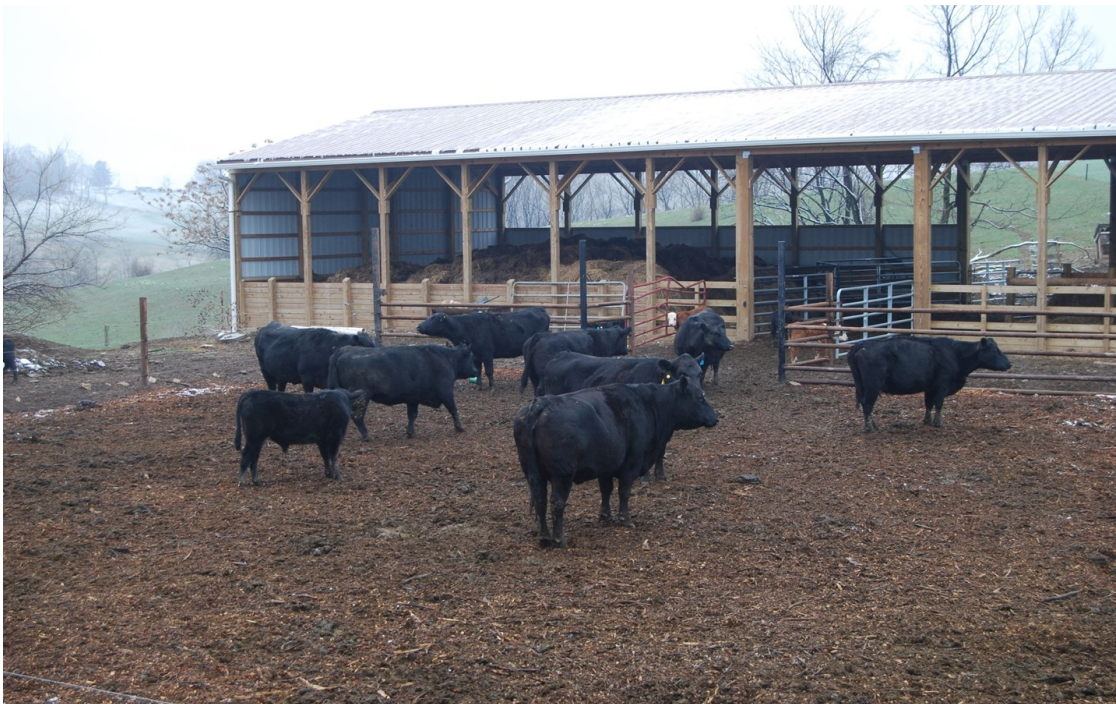
Woodchip pad in operation during late fall in West Virginia. Cattle are fed in adjacent roofed winter feeding structure, and have free access to the woodchip pad. Woodchips and spent manure are composted in the structure. Drainage water is sent to a vegetative treatment area (not visible).