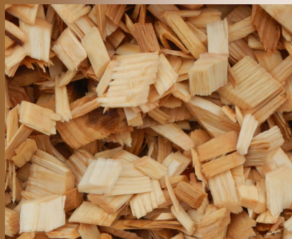
Large woodchips are important for woodchip pad longevity and drainage.