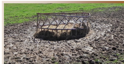
Pastures often become damaged during winter and late-fall/early-spring feeding.