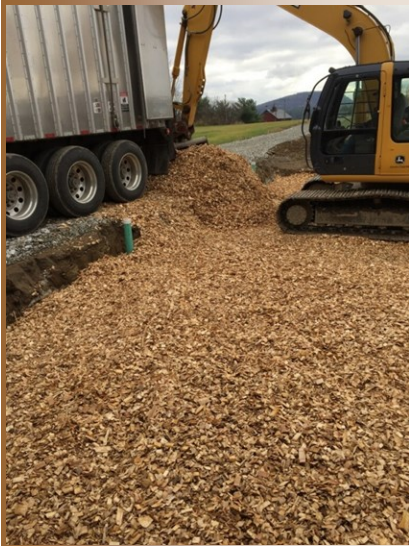
Woodchips being unloaded with a live-bed trailer, and spread with a excavator during construction.