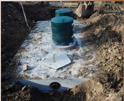
Buried holding tank for woodchip pad drainage water. Water is dosed from tank to adjacent vegetative treatment area.