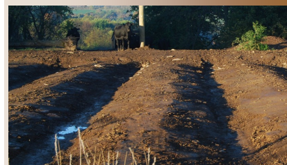
Shaping of woodchip pad subgrade to encourage drainage.