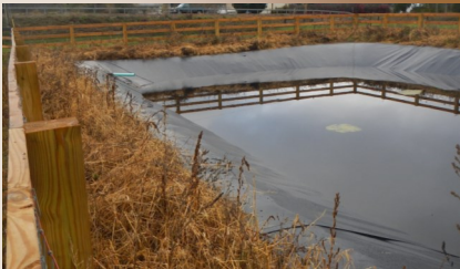
Drainage water holding pond constructed for effluent from a woodchip pad.