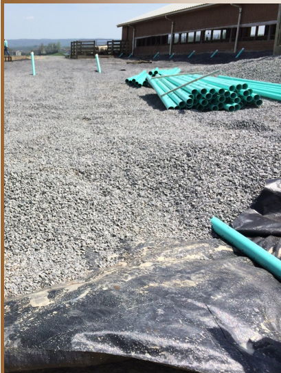
Geotextile between subgrade and drainage stone increasing bearing strength of surface and provides additional support for equipment traffic.