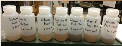
Water samples taken from woodchip pads using a variety of different types of woodchips.