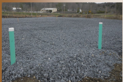
Drainage stone is placed over the perforated pipe. Accessible clean-outs are recommended to protect against clogging.