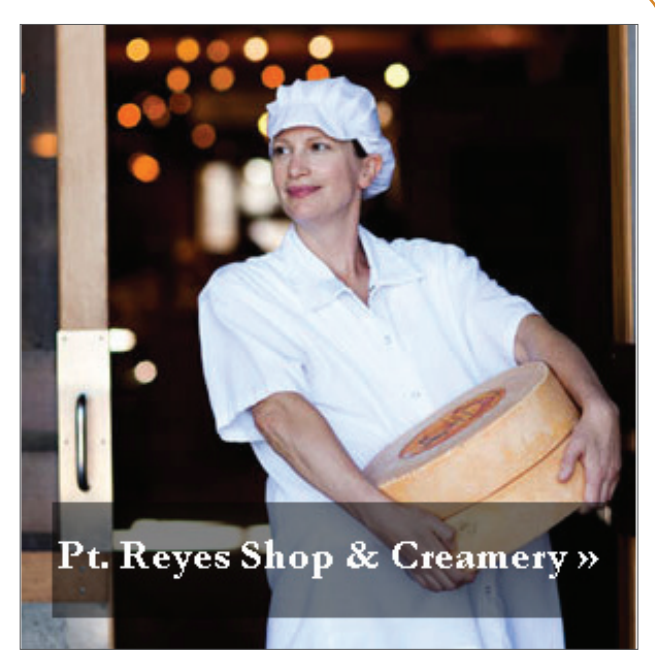
Cowgirl Creamery offers tastings at their shop in Pt. Reyes, CA and their factory in Petaluma.

owgirl Creamery is a San Francisco Bayarea cheese maker that offers tours of their production creamery in Petaluma and their former creamery (now a shop) in Pt. Reyes Station.