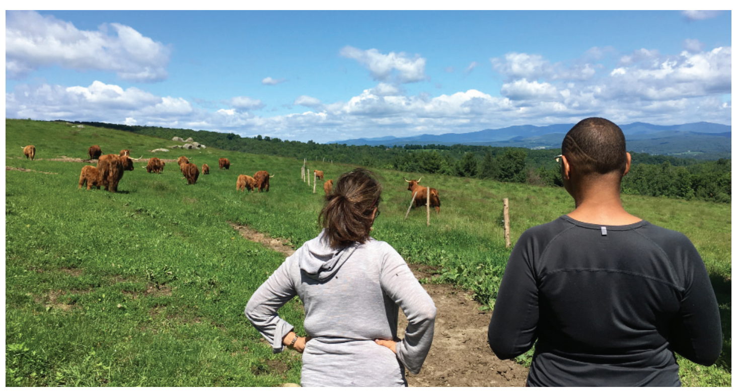
A farmer and guest on a field walk during a farm tour in Plainfield, Vermont.