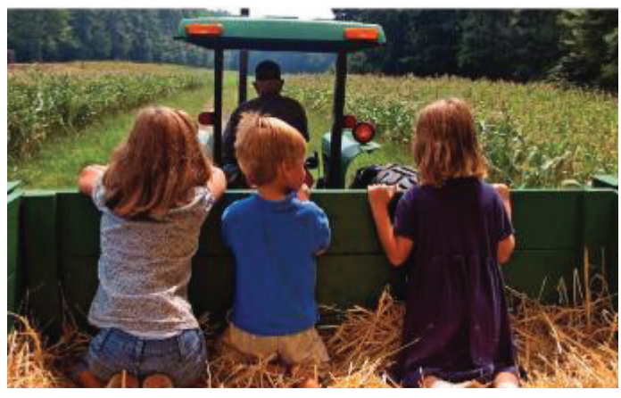
(Rutgers Cooperative Extension)

As far as agritourism activities go, farm tours are pretty safe, but it's always important to have appropriate insurance coverage. Your insurer will probably suggest that you have not only premise liability (covers the farm in the event of accident or physical injury to a visitor) and product liability (provides coverage against injury or illness resulting from ingesting farm products), but "commercial general liability," which combines liability insurance with property insurance.